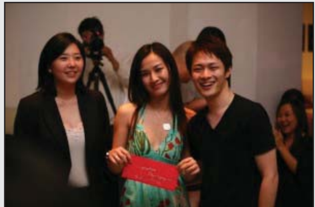
The happy winners