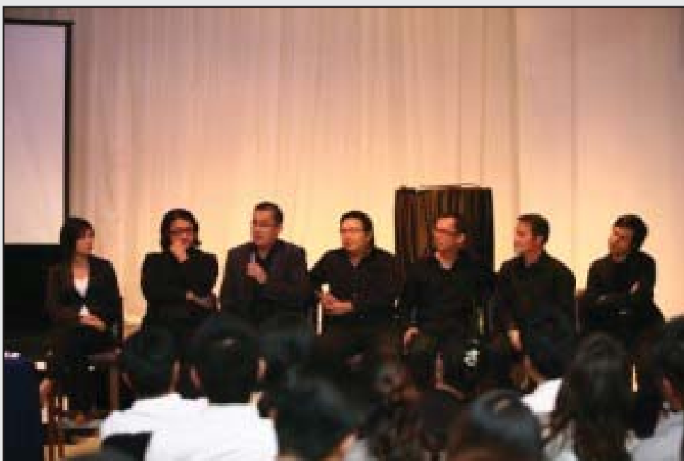
THE GROUP OF 7, ANSWERING QUESTIONS FROM THE FLOOR AT THE END OF THE EVENT.