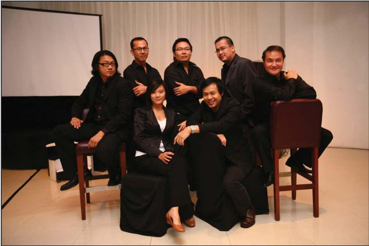
- THE SIGNATURE PHOTOGRAPHERS -