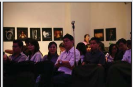
PARTICIPANTS BROWSING THROUGH THE WORKS AND ANXIOUSLY AWAITING THE START OF THE WORKSHOP

Held in Hotel Imperial, A Luxury Collection Hotel, Kuala Lumpur, the event lasted approximately 3 hours and saw all 7 of the Signature Photographers covering very informative topics that ranged from the benefits of engaging a professional photographer, to searching and selecting the preferred photographer all the way to how to be creative with wedding portraiture as well as posing techniques.